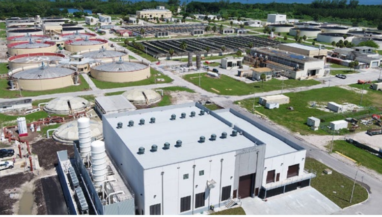
The Miami-Dade County Water and Sewer Department added a new, high-purity oxygen production facility at its Central District Wastewater Treatment Plant that will reduce energy consumption and increase reliability.