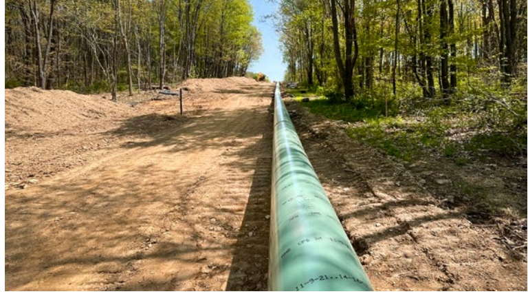
Peoples Natural Gas invests in pipeline replacement projects in Pennsylvania as part of its integrity management program to increase reliability and safety.