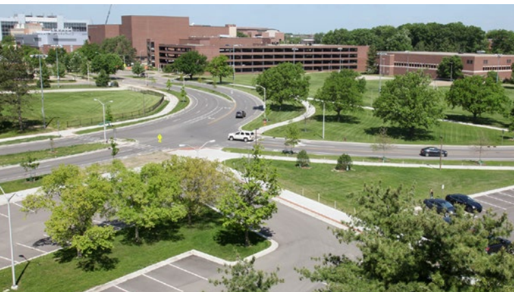
A major roadway reconfiguration through the heart of Michigan State University's campus accommodates increased and redirected traffic flow generated by the University's world-leading Facility for Rare Isotope Beams.