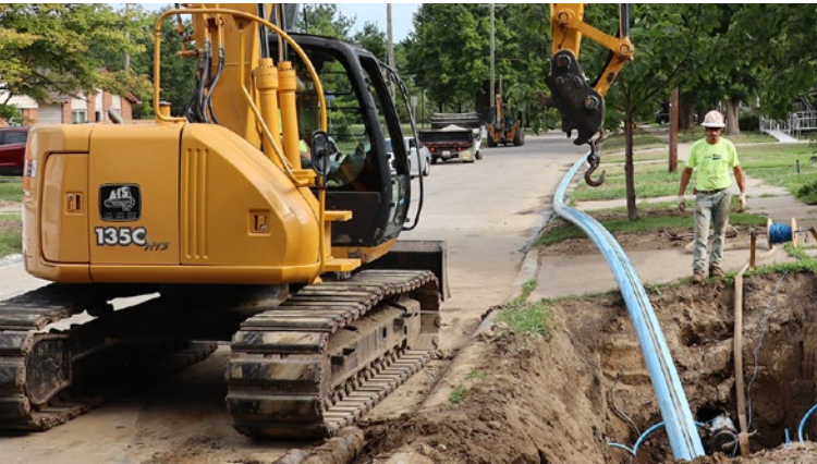
As part of our continuing engineering services for the City of Taylor, we design projects to rehabilitate or replace aging water main using trenchless installation methods that minimize construction impacts and cost.