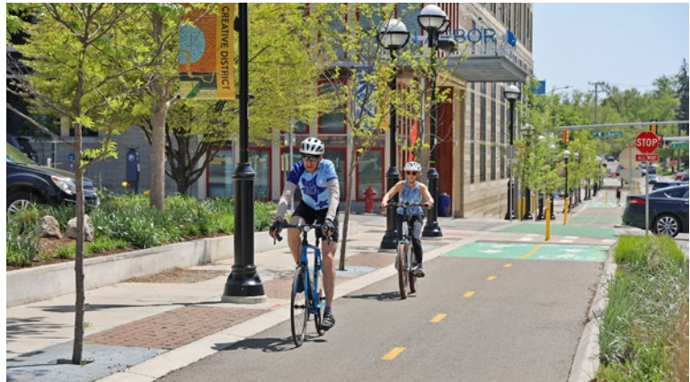
The City of Ann Arbor advanced their people-friendly streets initiative with two-way protected bikeways on William, First, and Division Streets to encourage people to bike and spend more time downtown.