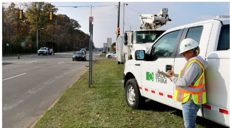
Construction engineering and inspection services were provided to the Michigan Department of Transportation for traffic signal modernization and sidewalk/ramp upgrades at nine intersections on US-12 and US-24.