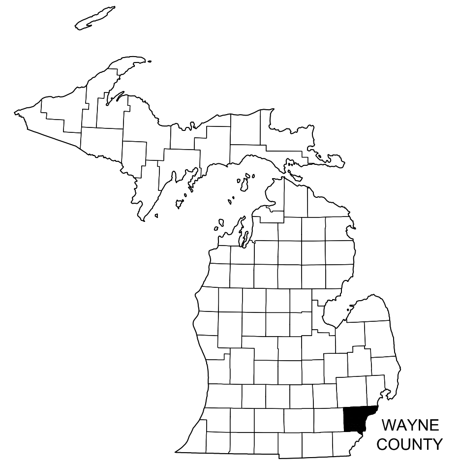
KEY MAP NOT TO SCALE