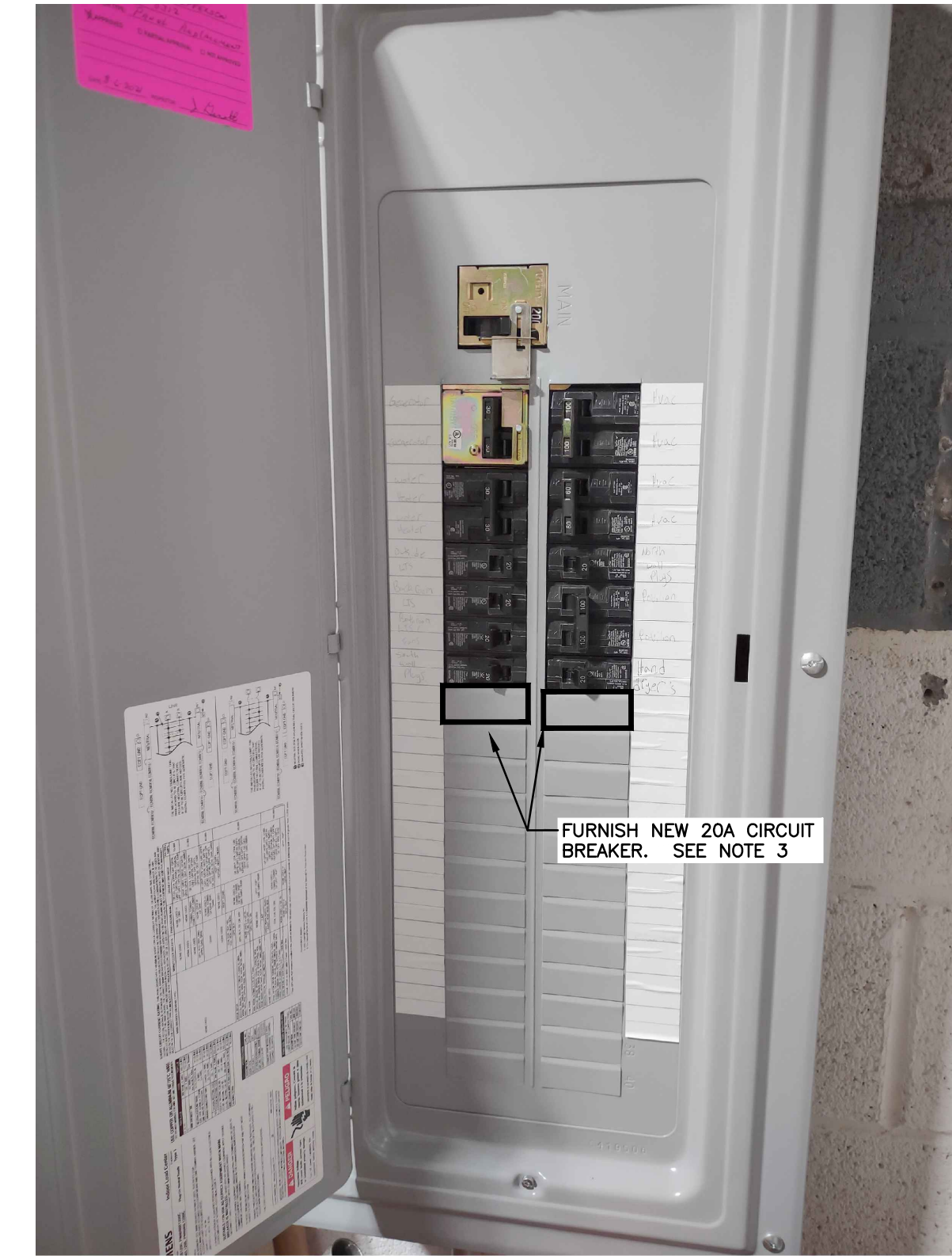
FURNISH NEW 20A CIRCUIT BREAKER. SEE NOTE 3